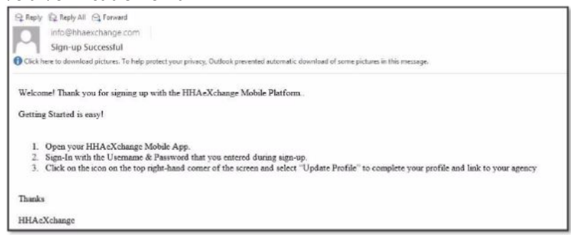
Successful Sign Up Email

Select [Sign Up] once you have entered your email and confirmed your password. These will serve as your log in credentials going forward. When you successfully created an account, you will receive a verification email.