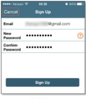
Sign Up Screen