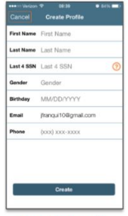
Step 3: Complete all the Fields

Complete all fields on the Create Profile page and click the [Create] button. If all the information has been entered correctly, a message will appear containing your Mobile ID :